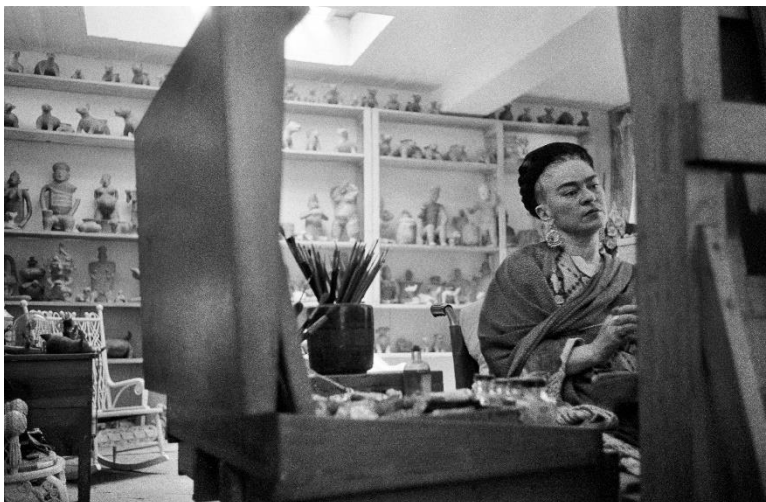
Frida Kahlo in her studio in Mexico City 1954.