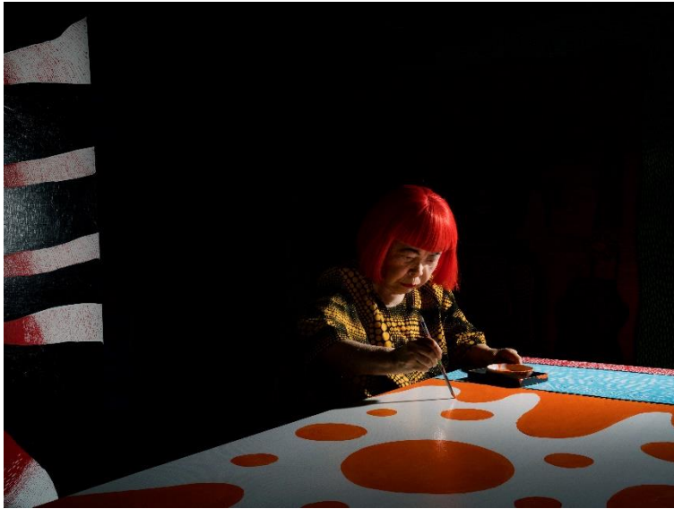
Yayoi Kusama in her Shinjuku studio in Tokyo 2016.