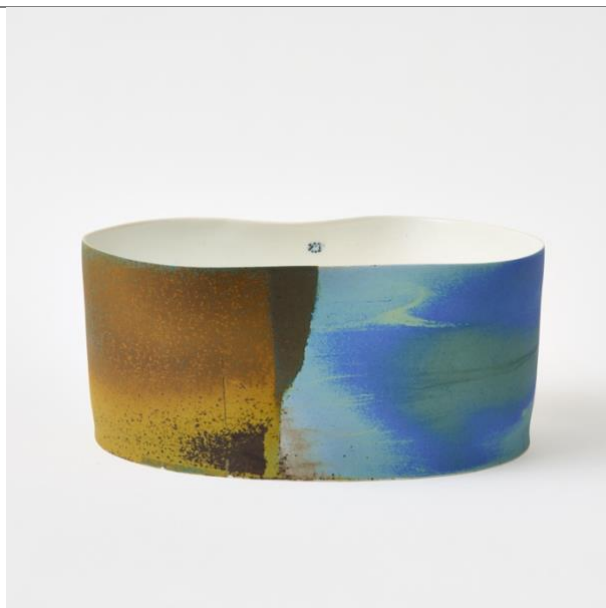
Hanne Heuch, Another Blue , 2023

Please make use of the images in the Press Kit .