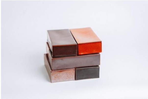
emmanuel boos, Extet , 2024 Porcelain, iron-based glazes