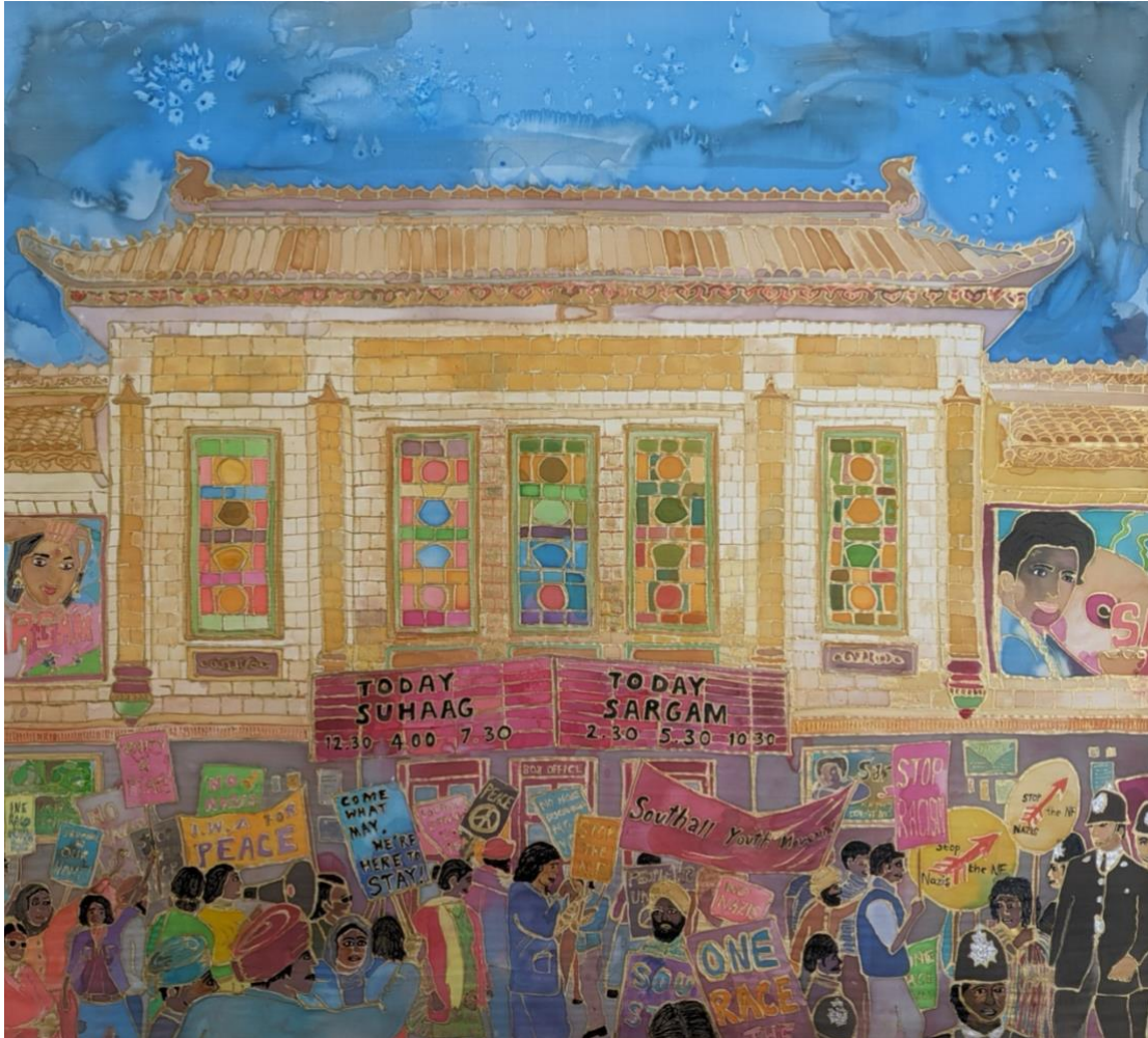
Year 6 children from Khalsa Primary School, Southall, Protestors Pass the Himalaya Palace Cinema , 23.04.1979, 2024. Silk Painting, 100 x 100cm.