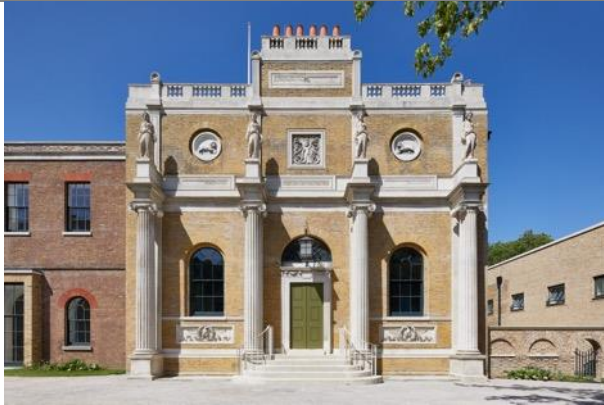
Front façade of Pitzhanger Manor.