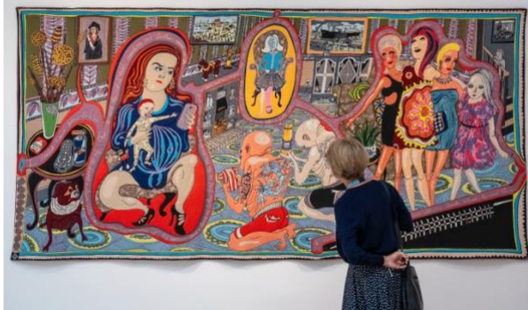
Grayson Perry, The Adoration of the Cage Fighters , 2012. Arts Council Collection, Southbank Centre, London © Stephen Chung. Gift of the artist and Victoria Miro Gallery with the support of Channel 4 Television, the Art Fund and Sfumato Foundation with additional support from AlixPartners

Please download high resolution images from the Press Kit .