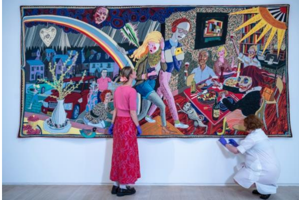
Grayson Perry, Expulsion from Number 8 Eden Close, 2012. Arts Council Collection, Southbank Centre, London Gift of the artist and Victoria Miro Gallery with the support of Channel 4 Television, the Art Fund and Sfumato Foundation with additional support from AlixPartners.