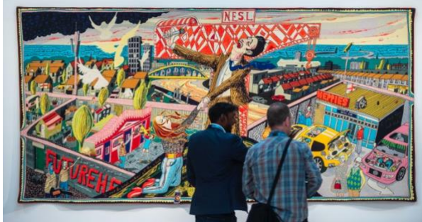
Grayson Perry, The Agony in the Car Park, 2012. Arts Council Collection, Southbank Centre, London. Gift of the artist and Victoria Miro Gallery with the support of Channel 4 Television, the Art Fund and Sfumato Foundation with additional support from AlixPartners