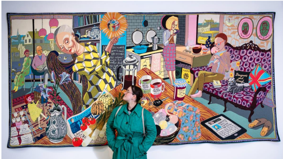
Grayson Perry, The Annunciation of the Virgin Deal, 2012. Arts Council Collection, Southbank Centre, London Gift of the artist and Victoria Miro Gallery with the support of Channel 4 Television, the Art Fund and Sfumato Foundation with additional support from AlixPartners.