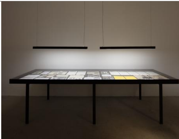
Prem Sahib, Archive , 2019. Wood, painted steel, acrylic, archival material belonging to Kamaljit Sahib. 79x300x80cm.