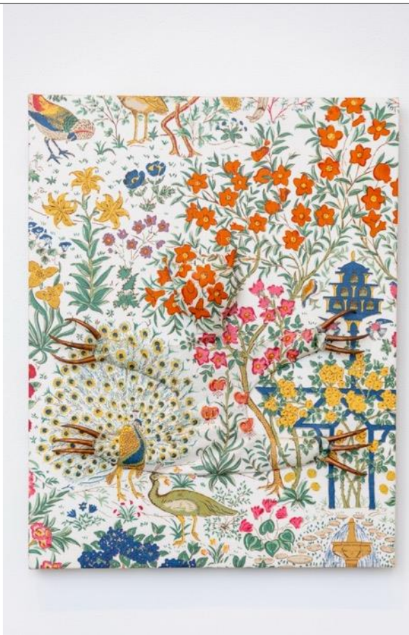
Perminder Kaur, One Swedish Sloth , 2018. Copper and fabric. 46x36cm.