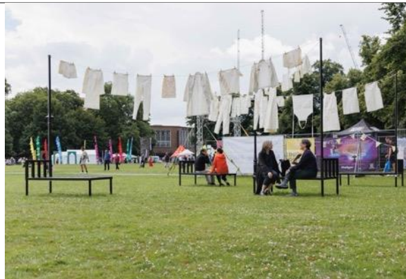
Perminder Kaur, Washing Line Beds , 2024. Steel, rope, fabric.

Please download high-resolution images from the Press Kit .