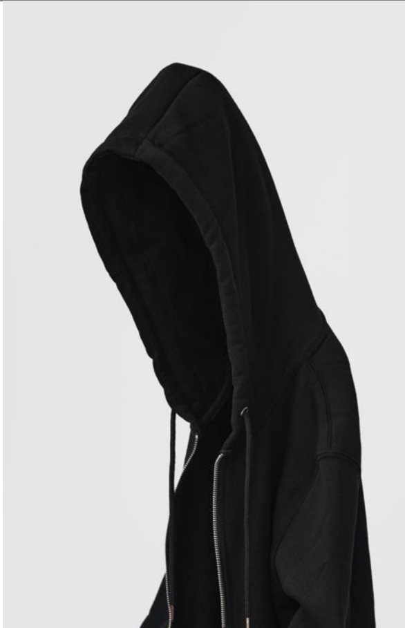
Prem Sahib, Apotropaic 1 (detail), 2023. Steel, aluminium, hoodies, wadding. 145x60x50cm.