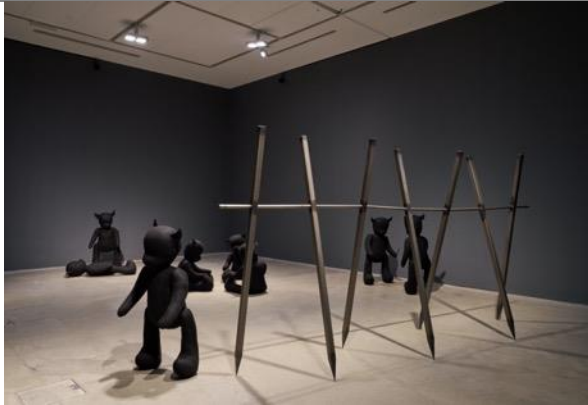
Perminder Kaur, Ten Teddies & Barrier , 2017. Steel and fabric. Size variable.