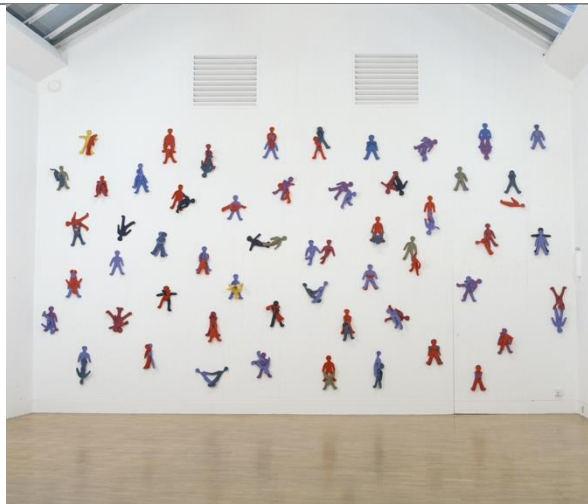
Permindar Kaur, You & Me , 1997. Polar fleece. Size variable.