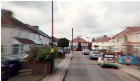
Prem Sahib, Cul-de-Sac , 2019. HD video projection, 5:58 min (loop).