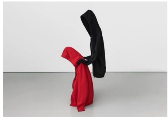
Prem Sahib, Apotropaic 1 , 2023. Steel, aluminium, hoods, wadding. 145x60x50cm.

Ealing, London: Pitzhanger Manor & Gallery is excited to announce the pairing of British artists Perminder Kaur and Prem Sahib in site-specific presentations of new and existing sculptural works across the galleries, manor, and gardens of architect Sir John Soane's former home. Whilst Kaur's exhibition Mirror, Mirror , will expand from the contemporary gallery spaces into the rooms of the historic manor, Sahib's major new bronze sculpture in Pitzhanger's gardens will be the starting point for Doubles , a series of interventions in the manor.