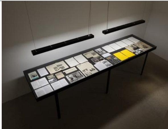
Prem Sahib, Archive , 2019. Wood, painted steel, acrylic, archival material belonging to Kamaljit Sahib. 79x300x80cm.