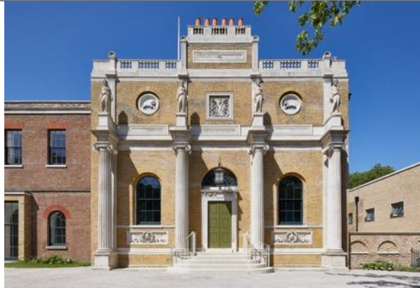
Front façade of Pitzhanger Manor. © Pitzhanger Manor & Gallery. Photo by Andy Stagg.